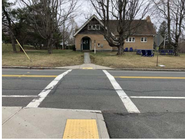
Crosswalk between library and general store