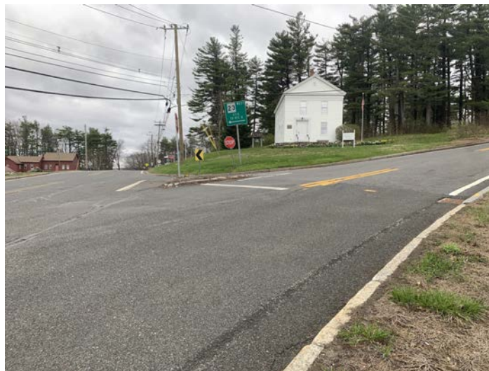
Existing North Street/Rt. 23 intersection has no marked crosswalk. A reconfiguration of the intersection could provide a protected crossing for people walking from the parking area to the Historical Society building.