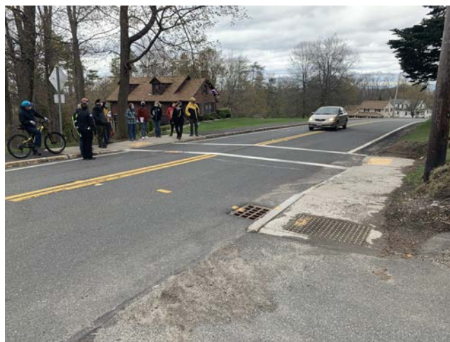
Existing crosswalk at Route 23 and Sunset Road.