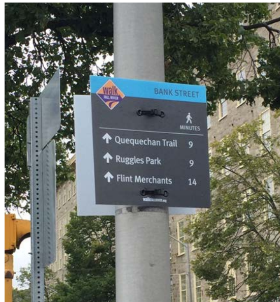
WalkBoston wayfinding signs in Fall River, MA