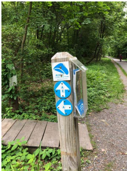
Directional signage in Lexington, MA