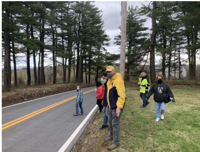
Walk audit participants cross North Street from the Town Common to the White Church.