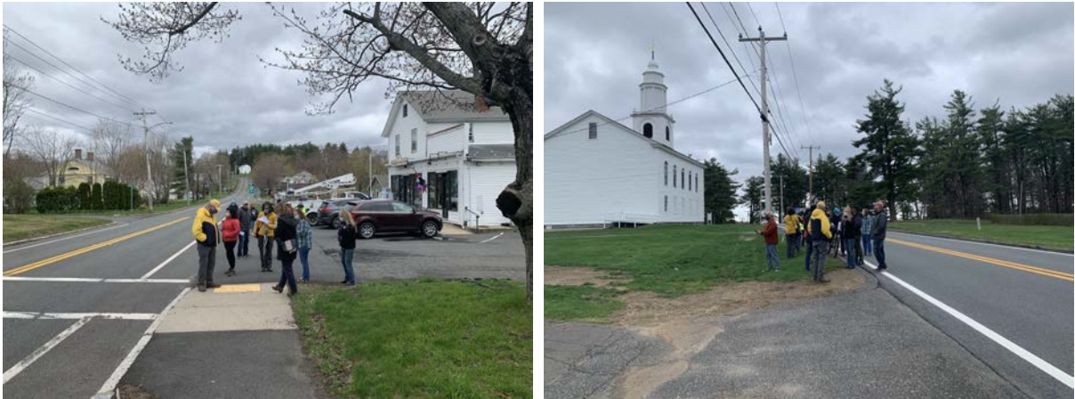
Images of the walk audit participants observing conditions along the walking route.