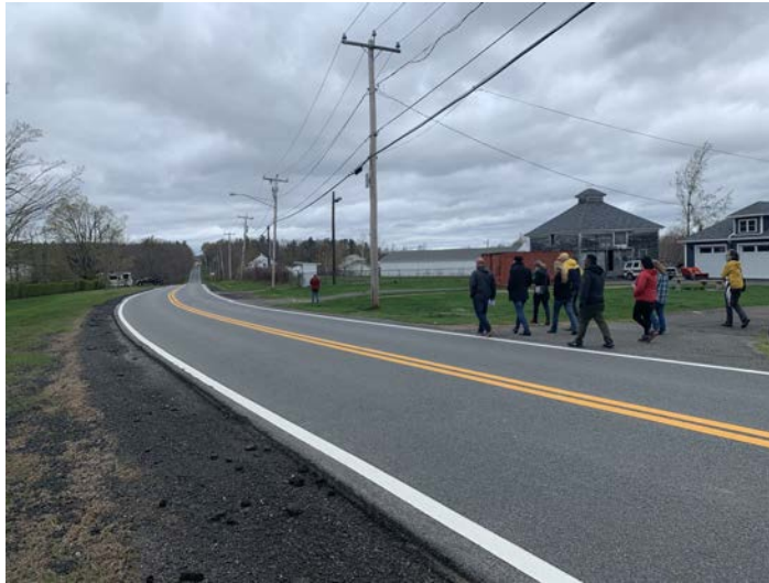
A sidewalk along North Street would better connect the destinations along the walking route and provide better pedestrian safety for event crowds and everyday walking.