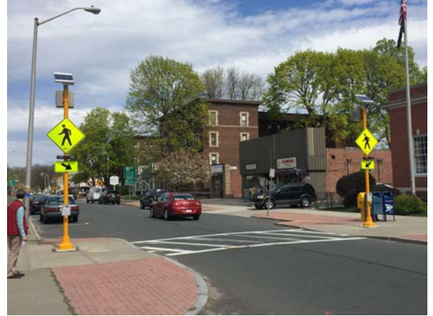
RRFB installation in West Springfield (model)