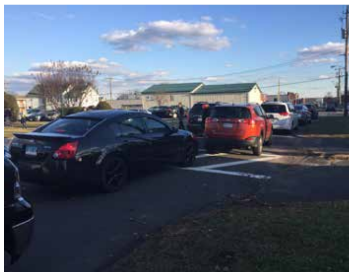
Traffic patterns on Norman Avenue at dismissal on a day when many children had left early after a schoolwide luncheon.

drop off and pick up students on both sides of the street. Children cross between cars, (often urged to do so by their parents), drivers park their cars on the crosswalks, and traffic can back up into the crosswalks at the Cold Spring/Norman Street intersection. If traffic flowed in only one direction from Cold Spring to River Street, there is room for a drop off lane and a travel lane, while also providing adequate width for a sidewalk on the south side of Norman Street. Children could load and unload on the school side of the street. Buses could arrive and drop off in a bus only drop off/loading zone (currently marked with signs). This change would discourage children from walking between cars by providing an easier drop-off and pick-up scenario.