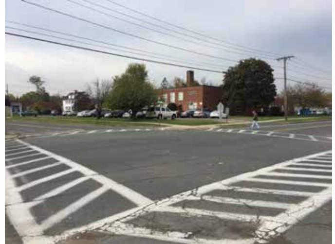
Well-marked, ladder crosswalks are at both major intersections near Memorial Elementary School.

Overall, the pedestrian infrastructure (crossings, sidewalks, etc.) is in good condition. Recently installed concrete sidewalks along Heywood Avenue, Norman Street, Baldwin Street, Bosworth Street, and Windsor Street provide smooth walking surfaces along these mixed residential/commercial corridors. Most intersections have curb ramps, detectable warning panels and well-marked ladder design crosswalks. However, there are some missing sidewalk links that, if improved, could help to encourage more students to walk to school.