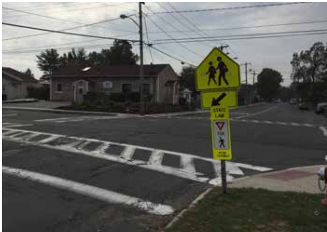
Missing stop sign at the intersection of Norman Street and Cold Spring Avenue.

There is no stop sign at the corner of the Norman Street/Cold Spring Avenue intersection for southwest-bound traffic traveling on Cold Spring Avenue. All other approaches to this intersection have stop signs. There is a stop line and pedestrian warning signage. We recommend that a stop sign be installed at this location.