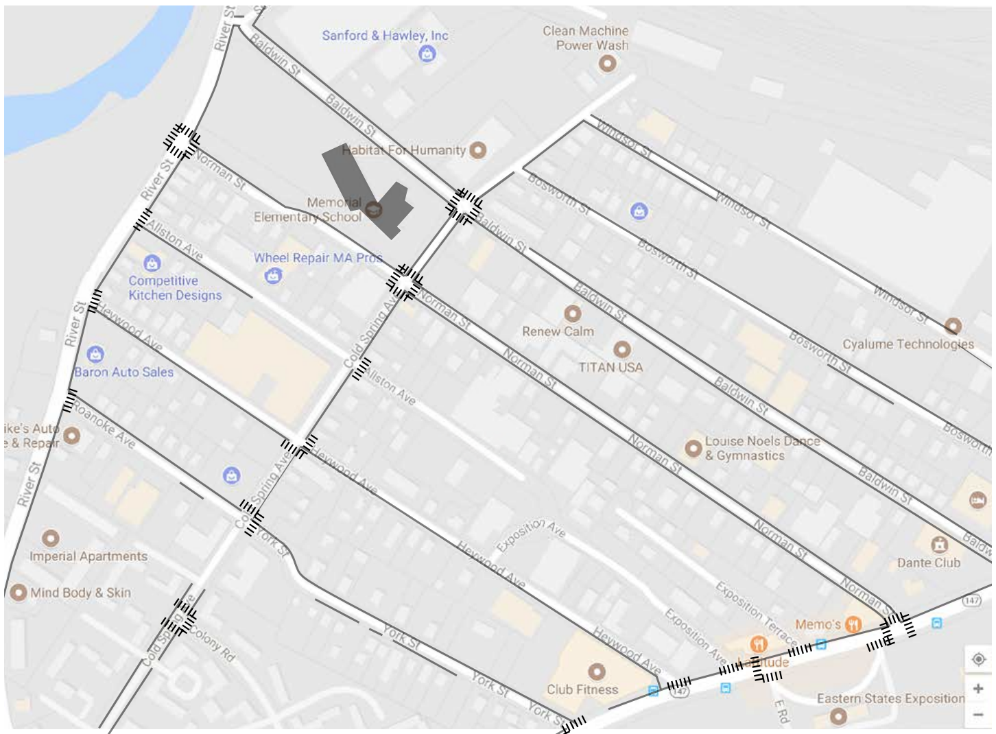
Sidewalk network and crosswalks in the study area.