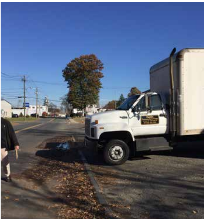
Truck parked on the sidewalk along Cold Spring Avenue.

In a “raise-your-hand” survey of Memorial School students conducted by Westfield State, 44% of the students are driven to school in a car (94 kids), 38% of students ride a yellow bus (83 kids), and 14% walk to school (31 kids). It is likely that many of the students that live within walking distance are driven to school. The primary physical barriers reported to discourage walking to school include truck traffic within the neighborhood, high (or perceived to be high) traffic speeds, and parking on the sidewalks, which forces students into the street. Walk audit participants confirmed that these barriers exist and witnessed some of them during the walk.