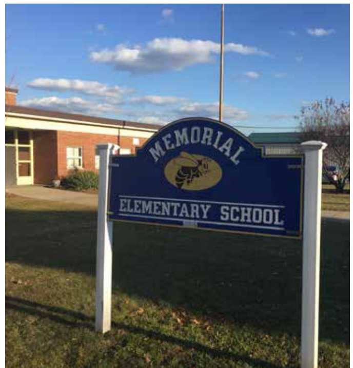
Memorial Elementary School front lawn.