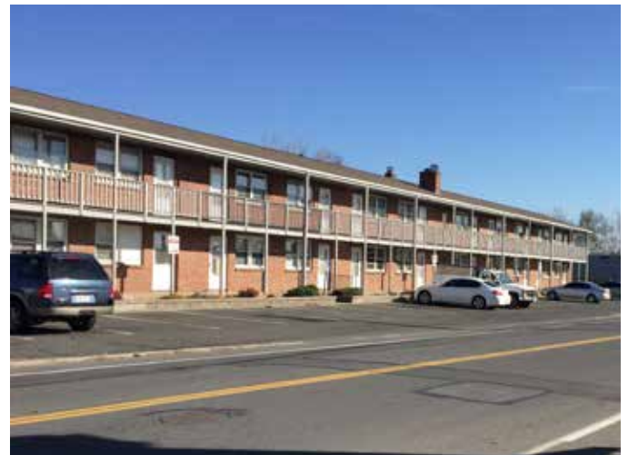
Parking in front of the apartment complex on Baldwin Avenue.

Allston Avenue is the only secondary street in the neighborhood without a sidewalk on at least one side of the street. While much of the road's land uses have switched from residential to office/light industry, there are several residences on the east side of Cold Spring Avenue that do not have a sidewalk. The sidewalk from River Street along Allston Avenue ends before reaching Cold Spring Avenue. We recommend that a concrete sidewalk be installed along the south side of Allston Street between Cold Spring Avenue and the end of the road leading to almost Exposition Avenue (approx. 575') and completed from Cold Spring Avenue west to River Street (approx. 370').