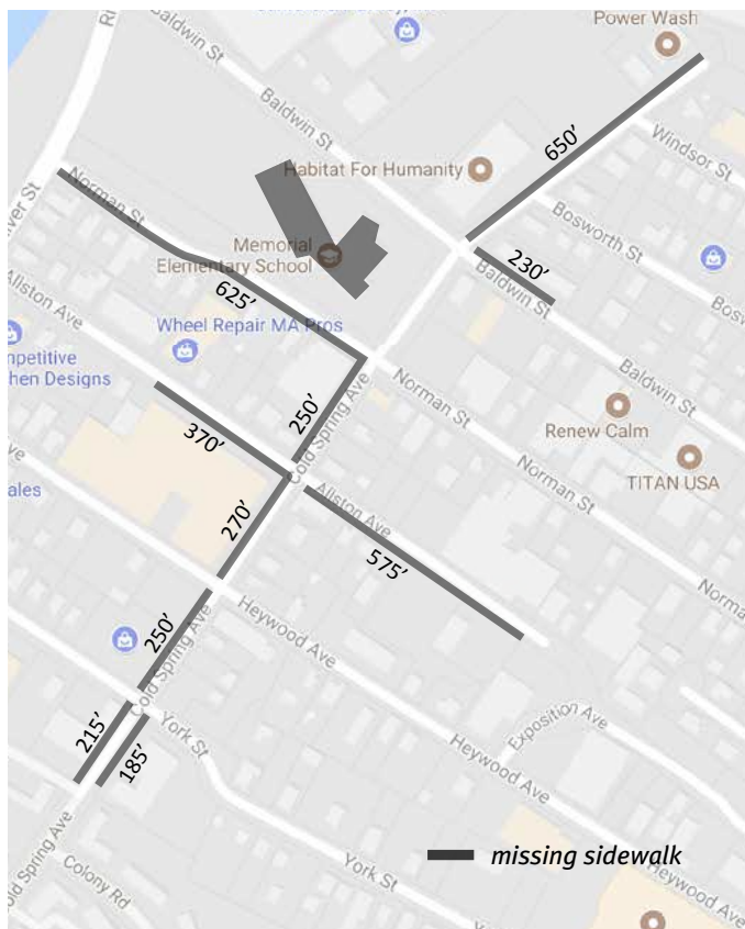
Cold Spring Avenue is a key walking route for children attending Memorial Elementary School. New sidewalks should be installed to complete the missing links. Norman Street holds higher volumes of cars and people during arrival and dismissal and needs a sidewalk on the south side.

Several business owners allow their staff to park on or near sidewalks along Cold Spring Avenue, the most egregious being on the west side of Cold Spring Avenue between Norman Street and Allston Avenue. The Town should continue to work with those business owners to balance the need for parking with safe walkways.