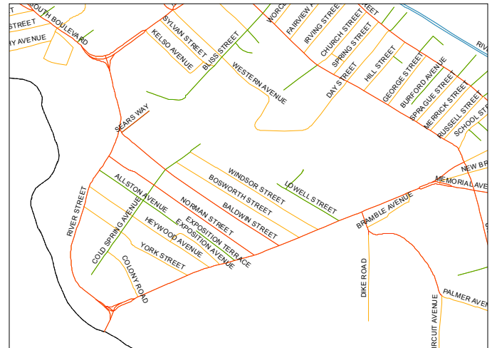
Memorial School neighborhood on the Snow Plow Priority Map (Town of West Springfield 12/23/2015).

In addition to the ordinance, West Springfield has also classified its streets as primary, secondary and tertiary priority for snow removal based on roadway classification, such as major thoroughfares, through streets, and cul-de-sacs. Within the study area, Norman Street and Baldwin Street are considered primary priority because they are major thoroughfares. Cold Spring Avenue is considered tertiary priority because it is a cul-de-sac.