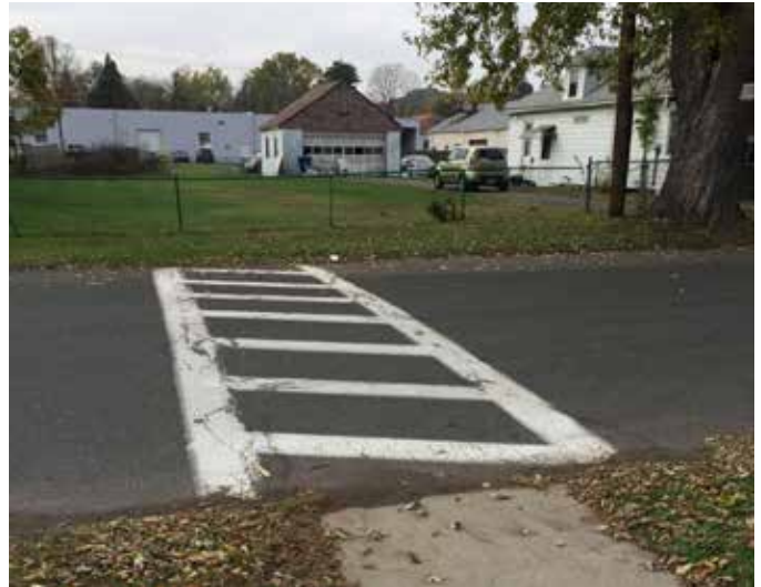
Crosswalk on Norman Street that leads to grass rather than a sidewalk.

The current school arrival and dismissal patterns allow two-way car traffic along Norman Street where parents