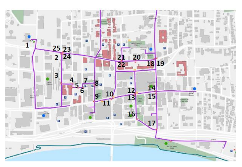
A map of the wayfinding loop designed for downtown Springfield.

Sign Location: Through a combination of on-the-ground fieldwork and virtual scouting/distance measuring via Google Maps and Google Earth (including use of the Streetview feature), WalkBoston and local partners identified specific streets and poles that met the specifications for the desired walking routes. (At several locations in Fall River where no poles were available, WalkBoston used sidewalk decals instead.) WalkBoston then created spreadsheets with specific details for each individual sign, including its