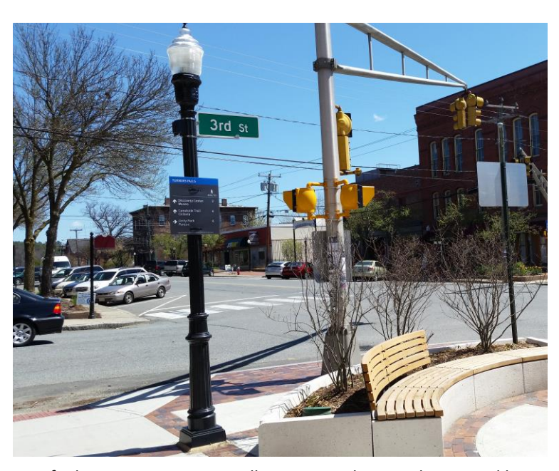
Wayfinding signs in Turners Falls orient residents and visitors alike to destinations in the downtown village area.

WalkBoston worked with the town and FRCOG Planning staff to design signage focused on utilitarian walking, but serving visitors as well. The Montague Planning Director worked closely with WalkBoston to identify pedestrian routes in the town center and to select locations along those routes for signs that would help pedestrians navigate the center by showing destinations and walking times. Destinations included local landmarks, parks, the library, markets, and the community theatre. In addition, the signs indicate the state historic museum/discovery center at the Connecticut River Falls and the network of bicycle routes throughout the community, which also serve as extended walking routes. The signs were in both English and Spanish so