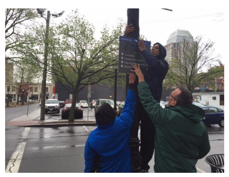
Springfield staff install wayfinding signs to create a two-way walking loop between downtown destinations.

To inform the wayfinding installation, students from UMass-Amherst conducted a survey in February and March of 2016 to assess the ways that people, especially pedestrians, travel to and through the downtown/Metro Center area of Springfield. The survey provided information about respondents' familiarity with the location of specific destinations in the downtown area, whether they knew how to get to those destinations on foot, and whether they knew how much time it takes to get to those destinations on foot.