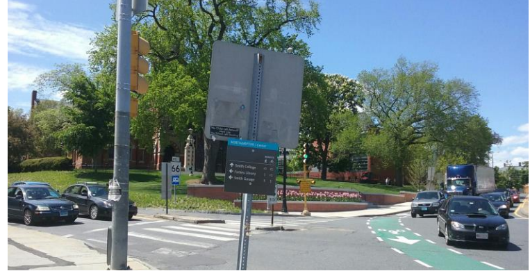
Wayfinding signs in Northampton connect regional walking and biking trails to destinations in the City, and vice versa.

Destinations included local landmarks, such as the Smith College buildings, parks, the library, markets, and the community theatre. In addition, signs