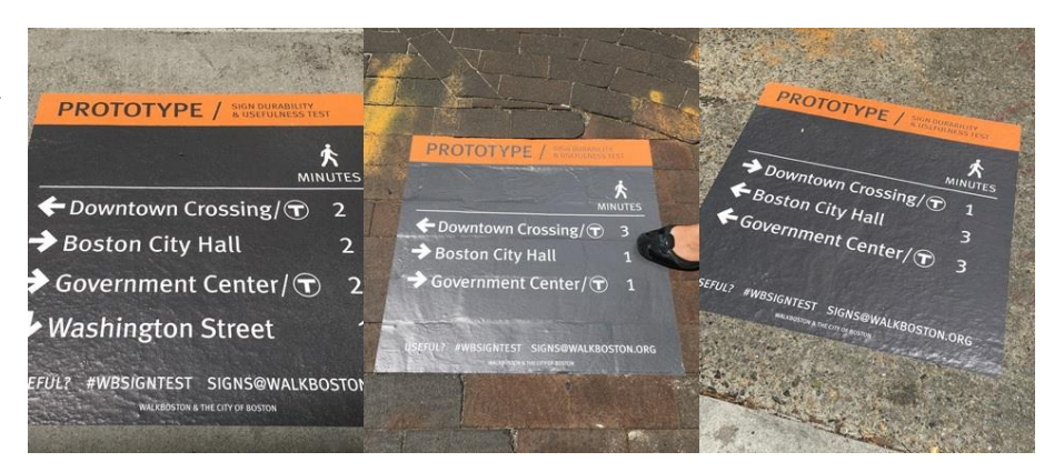
WalkBoston installed three wayfinding pavement decals near its office in downtown Boston to test their durability. The decals encouraged viewers to send feedback to WalkBoston via e-mail and social media.

The quality of the sidewalk surface may affect the durability of the decals. The three decals were installed on different portions of the sidewalk, each with a distinctive surface. One sign was located on a brick sidewalk, one on a relatively smooth concrete portion of sidewalk, and one on a concrete surface